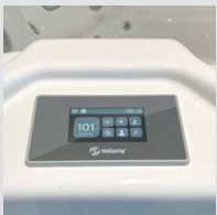
Colour LCD Touchscreen