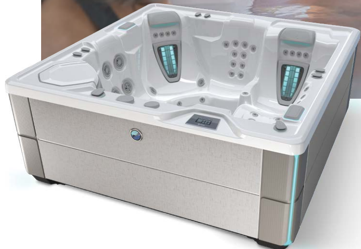
Shown with Alpine White Shell and Blackwood Cabinet

People Seating Jets Voltage 5 Seats Lounge 42 Jets 230 V