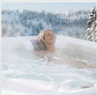
Super Energy Efficient