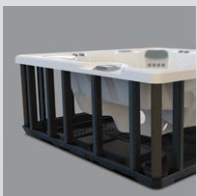
Polymer Substructure & Base Pan