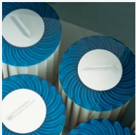
100% Filtration SilentFlo Circulation