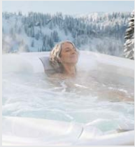
Super Energy Efficient