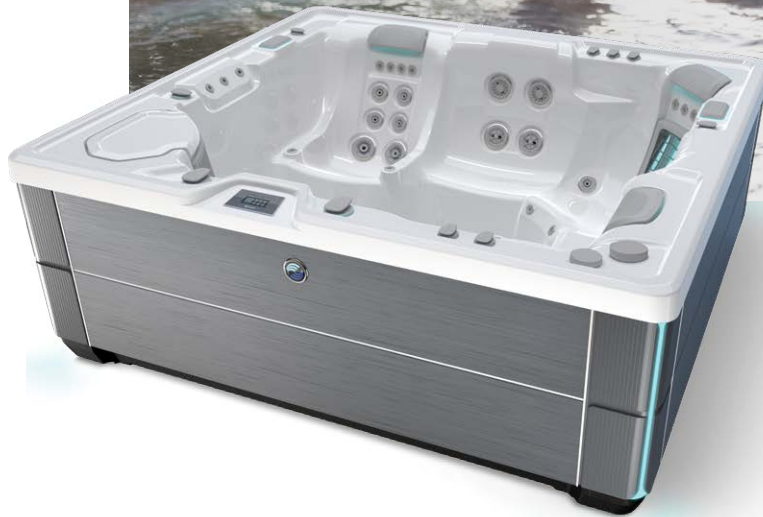
Shown with Alpine White Shell and Charcoal Cabinet

People Seating Jets Voltage 5 Seats Lounge 55 Jets 230 V