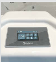
Colour LCD Touchscreen