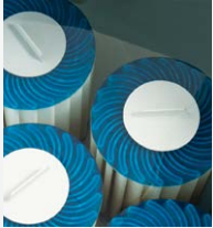
100% Filtration SilentFlo Circulation