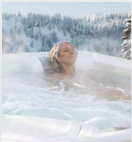
Super Energy Efficient