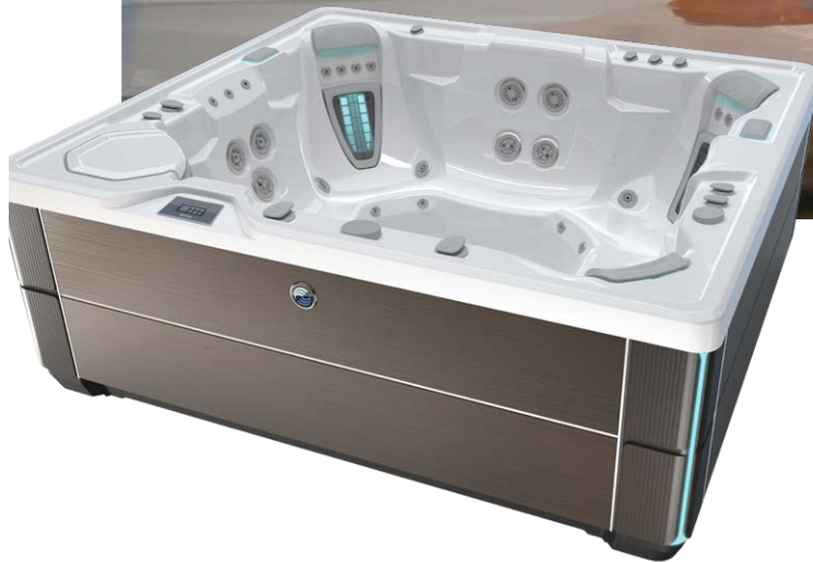
Shown with Alpine White Shell and Java Cabinet

People Seating Jets Voltage 7 Seats Open 49 Jets 230 V