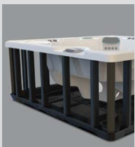
Polymer Substructure & Base Pan