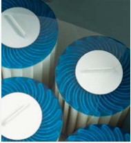
100% Filtration SilentFlo Circulation