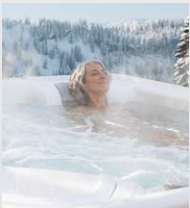
Super Energy Efficient