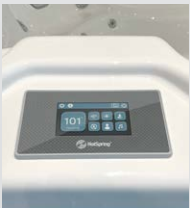
Colour LCD Touchscreen