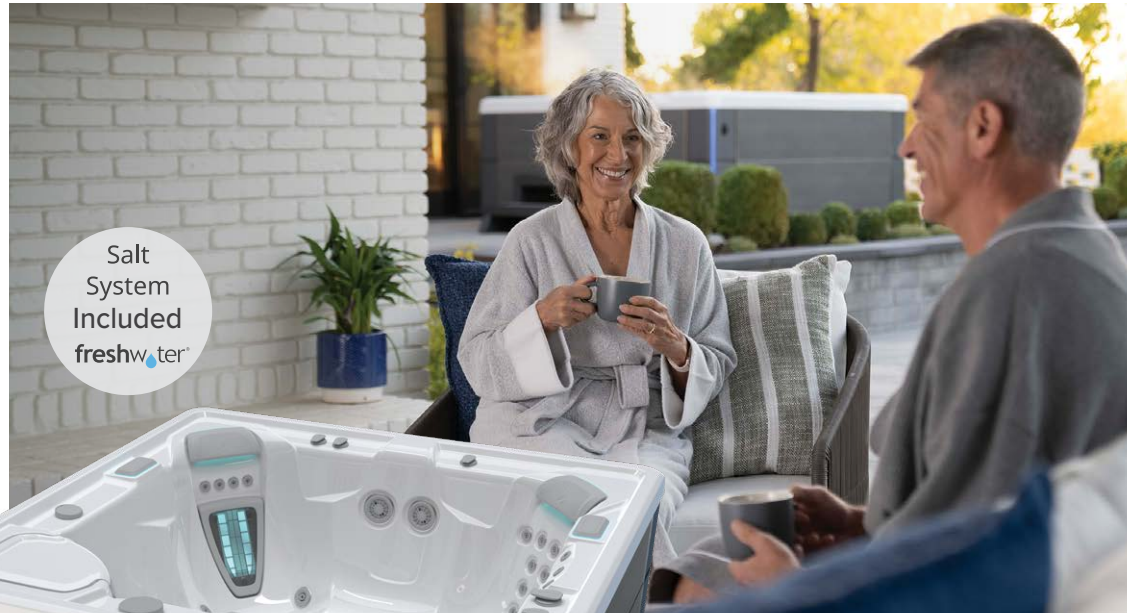
Shown with Alpine White Shell and Java Cabinet