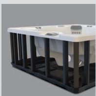
Polymer Substructure & Base Pan