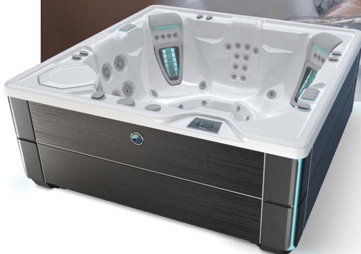
Shown with Alpine White Shell and Blackwood Cabinet

People Seating Jets Voltage 6 Seats Open 42 Jets 230 V