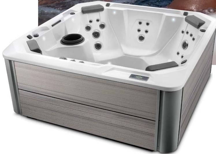
Shown with Alpine White Shell and Almond Cabinet.

People Seating Jets Voltage 7 Seats Open 40 Jets 230 V/ 16 amp