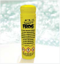
FROG® In-Line Sanitising System