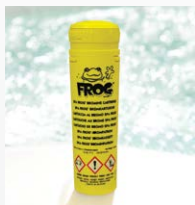
Frog® In-Line Sanitising System