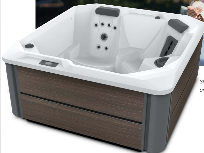
Shown with Alpine White Shell and Havana Cabinet.