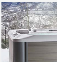
FiberCor® High-Density Insulation