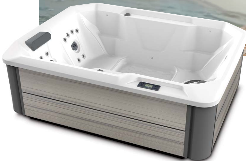
Shown with Alpine White Shell and Almond Cabinet.