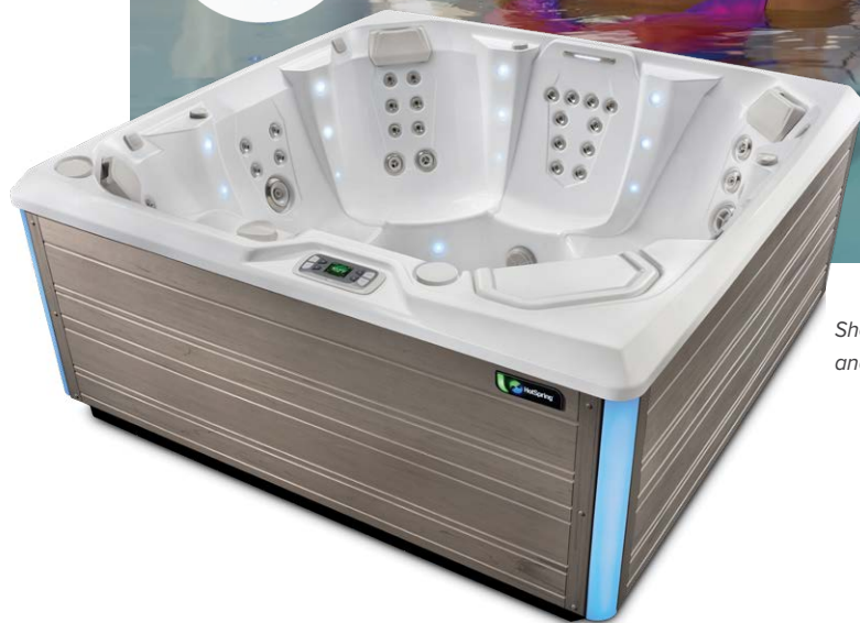
Shown with Alpine White Shell and Coastal Grey Cabinet

People Seating Jets Voltage 7 Seats Open 41 Jets 230 V