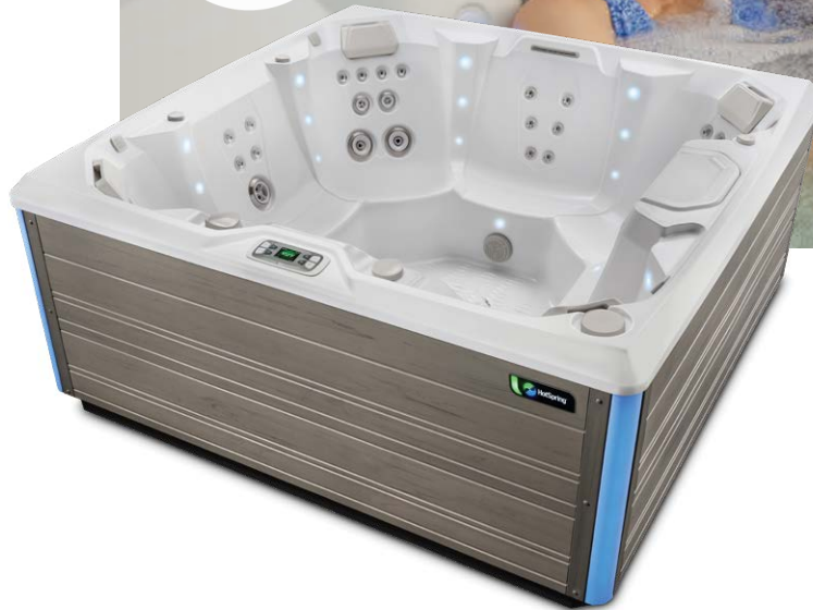
Shown with Alpine White Shell and Coastal Grey Cabinet