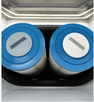
Dual Action Filtration SilentFlo Circulation