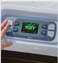
Colour LCD Display