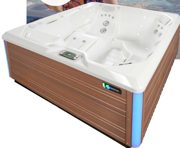
Shown with Alpine White Shell and Sable Cabinet

People Seating Jets Voltage 4 Seats Lounge 23 Jets 230 V