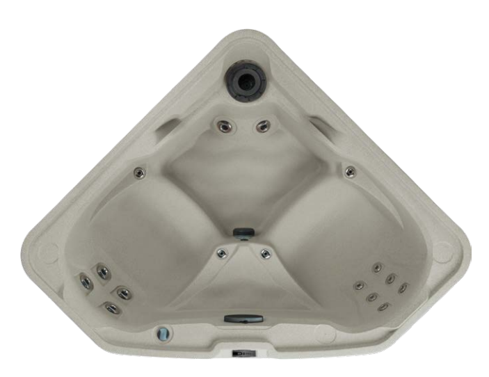
Tristar shown in Sand