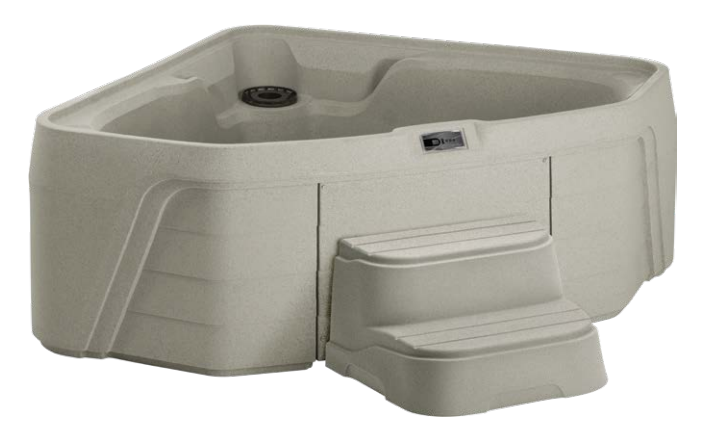
Tristar shown in Sand