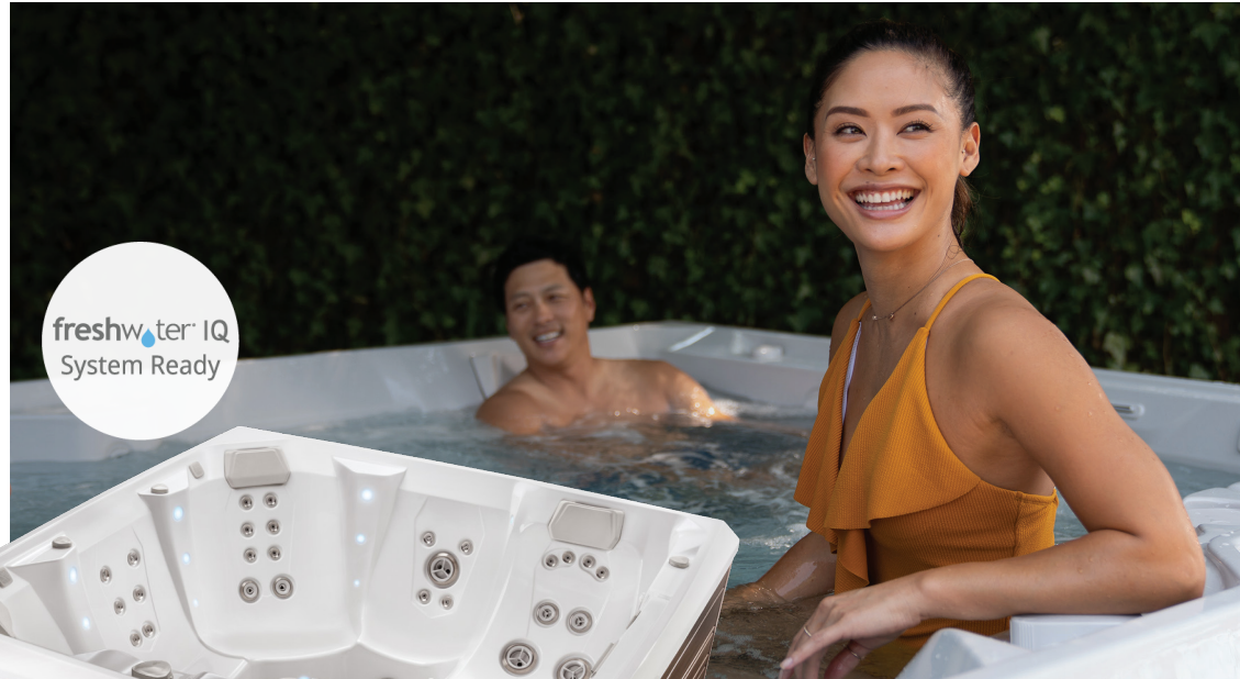
Shown with Alpine White Shell and Sable Cabinet